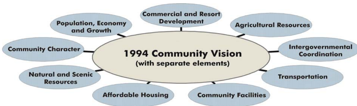
Figure V.1: The 1994 Community Vision discussed achieving each community issue as a component of maintaining community character.